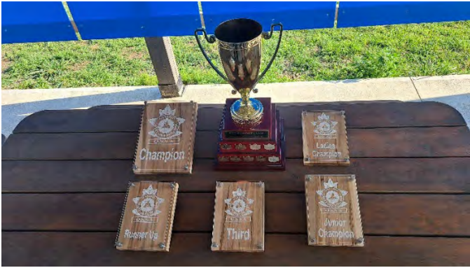
Doubles Trophy with Presentation Plaques