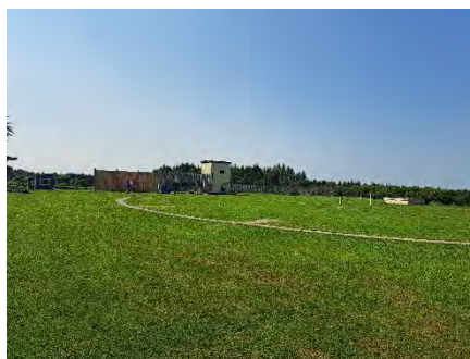
Oshawa, July 2025