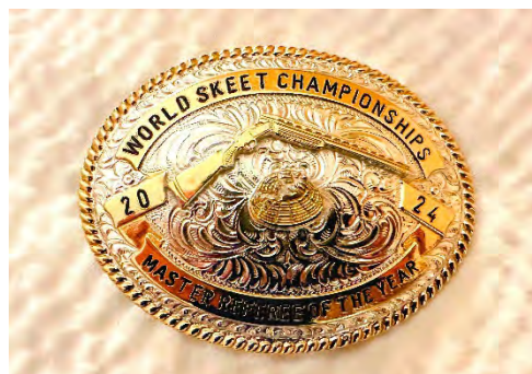
Belt Buckle – Master Referee of the Year